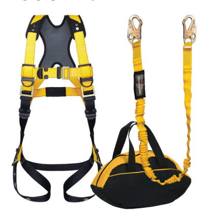
Series 3 Harness, Shock Absorbing 6 ft Lanyard and Carry Bag