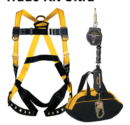
Velocity Harness, CR3-Edge 10 ft SRL-P and Carry Bag