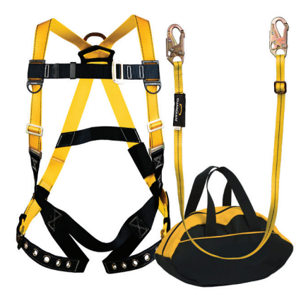
Velocity Harness, Non-Shock Absorbing 4-6 ft Adjustable Restraint Lanyard and Carry Bag