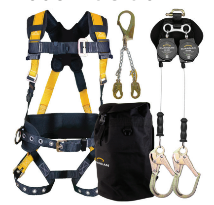
Seraph Harness, CR3-Edge Dual 8 ft SRL-P, Chain Rebar Assembly and Backpack