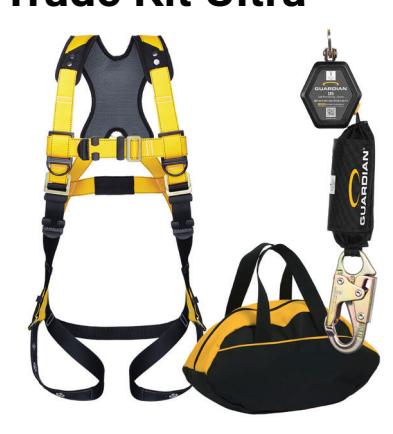
Series 3 Harness, CR5 6 ft SRL-P and Carry Bag