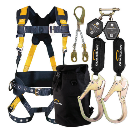
Seraph Harness, CR5 Dual 6 ft SRL-P, Chain Rebar Assembly and Backpack