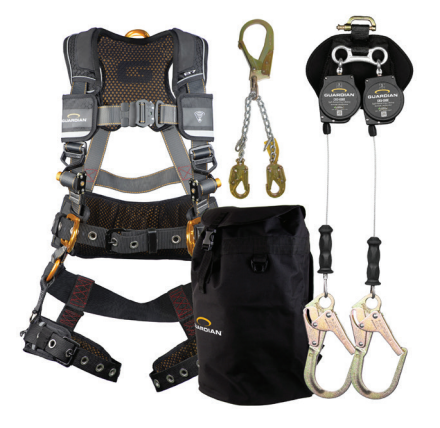
B7-Comfort Harness, CR3-Edge Dual 8 ft SRL-P, Chain Rebar Assembly and Backpack