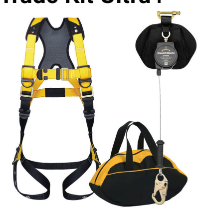
Series 3 Harness, CR3-Edge 8 ft SRL-P and Carry Bag